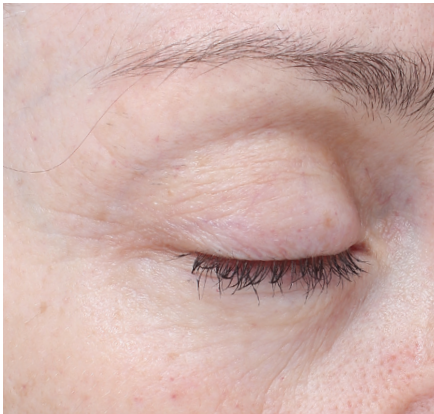
After 30 days